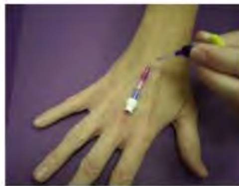
Transparent dressing + skin glue